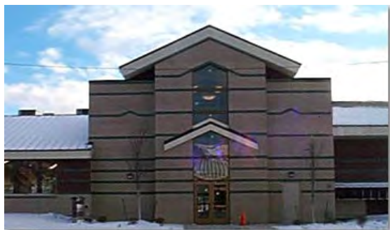
The Fremont Area District Library.

FOML will hold two workshops in April 2013 at the Fremont Area District Library.